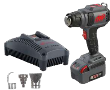
reflector, round, and flat