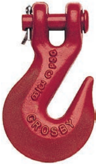
H-330 / A-330 Clevis Grab Hook