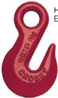
H-323 / A-323 Eye Grab Hook