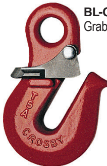
BL-GRB Grab Hook with Latch