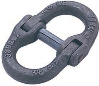
A-336 Connecting Link