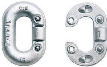
G-335 / S-335 Replacement Link

* Ultimate Load is 4 times the Working Load Limit. ** Rivets Only - No interlocking lugs. † Has reinforced rivet holes. All sizes have countersunk rivet holes. Not Suitable for use with Grade 80 or Grade 100 chain and chain slings used in overhead lifting.