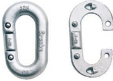
G-334 / S-334 Replacement Link