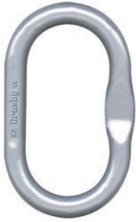
A-1342N Master Link