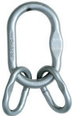
A-1345N Master Link Assembly

* Minimum Ultimate Load is 4 times the Working Load Limit. ** Welded.