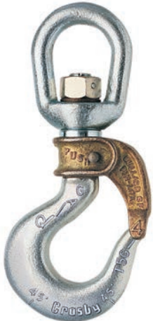
Closed Swivel Bail