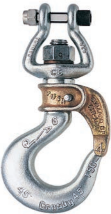
Open Swivel Bail