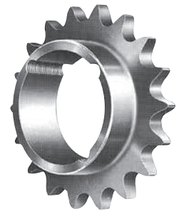
Table No. 2 Steel Double Sprockets