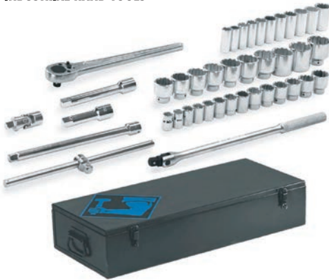
Fastenal No. 0239754 Apex No. 15-700