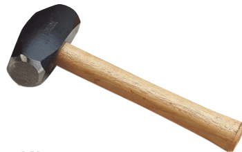
Fastenal No. 0242308 Apex No. 69-605 Hand Drilling Hammer