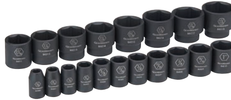
Fastenal No. 0253037 Apex No. 84932