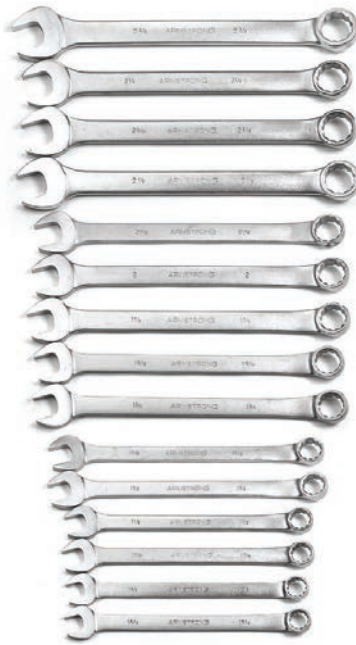
Fastenal No. 0241236 Apex No. 25-658