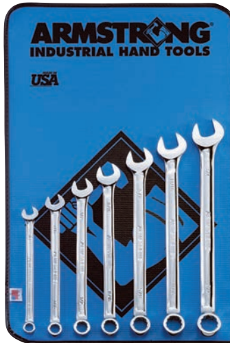
Fastenal No. 0241234 Apex No. 25-631