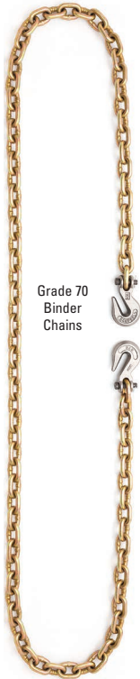
Grade 70 Binder Chains