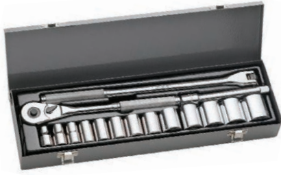
Fastenal No. 0265235 Apex No. 15-518A