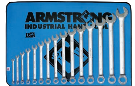
Fastenal No. 0239830 Apex No. 25-681