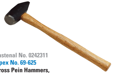
Fastenal No. 0242311 Apex No. 69-625 Cross Pein Hammers,