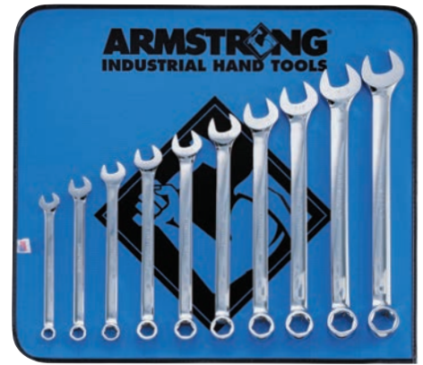
Fastenal No. 0239824 Apex No. 25-626